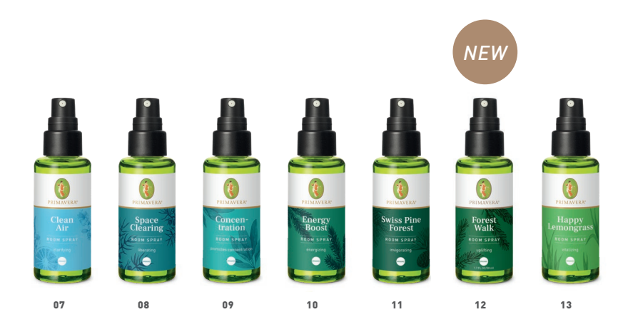
WHICH COLOR WILL IT BE TODAY?